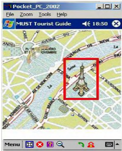
Figure 2: Screen Layout of the MUST tourist guide

Speech input allows what we call shortcuts. For example, at the top navigation level (where the overview map with POIs is on the screen) the user can ask questions such as 'What hotels are there near the Notre Dame?'. That request will result in the detailed map of the Notre Dame, with the locations of hotels indicated as selectable objects. However, until one of the hotels is selected, the Notre Dame will be considered as the topic of the dialogue.