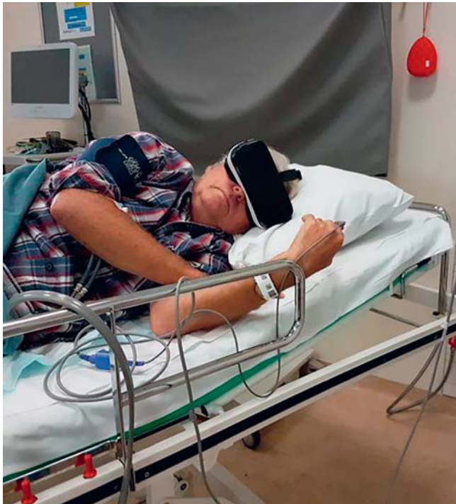
► Fig. 2 Samsung Gear VR shown on a patient during colonoscopy (with permission).

(► Fig. 2 ). No adverse events associated with VR distraction in combination with medication were observed. One endoscopist performed all the procedures (FV) except one in the VR group (BvH). FV had >5 years of experience, BvH >3 years.