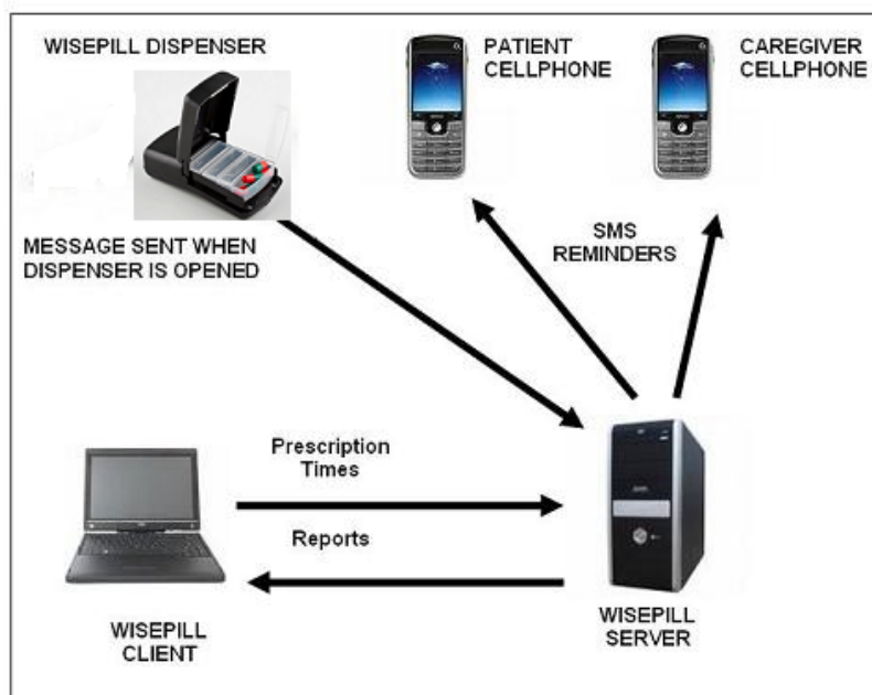
Figure 2. Wisepill device architecture.