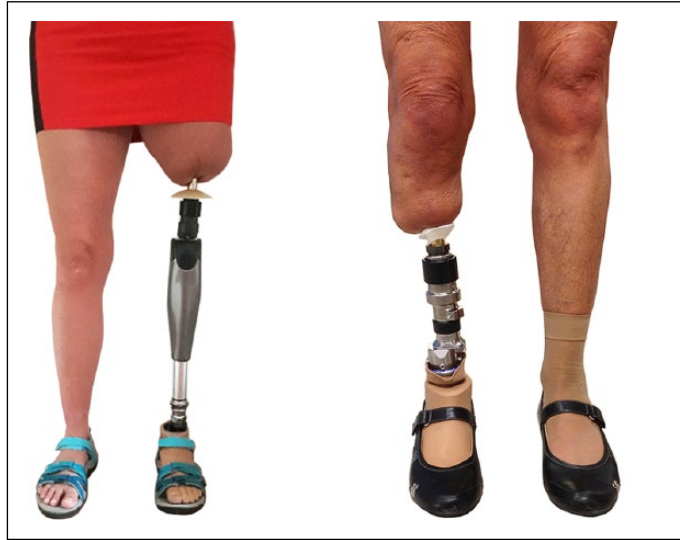
Figure 2. Bone-anchored prostheses. Left: transfemoral bone-anchored prosthesis and right: transtibial bone-anchored prosthesis.