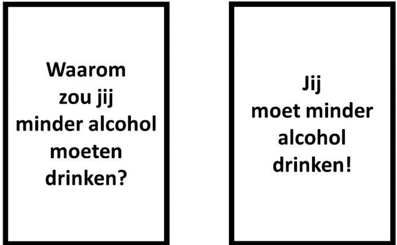
Fig 1. Stimulus materials in the experiment. Left is self-persuasion: “Why do you have to drink less alcohol?”; right is direct persuasion: “You have to drink less alcohol!”.

https://doi.org/10.1371/journal.pone.0211030.g001