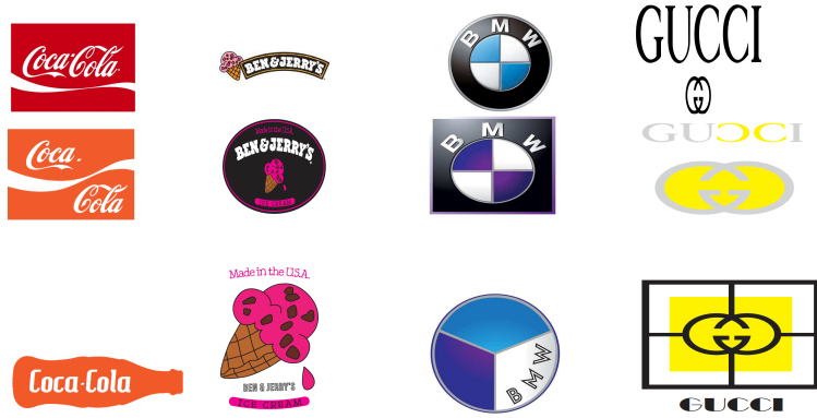
Figure 2: Logo change (original, small, substantial) across brands