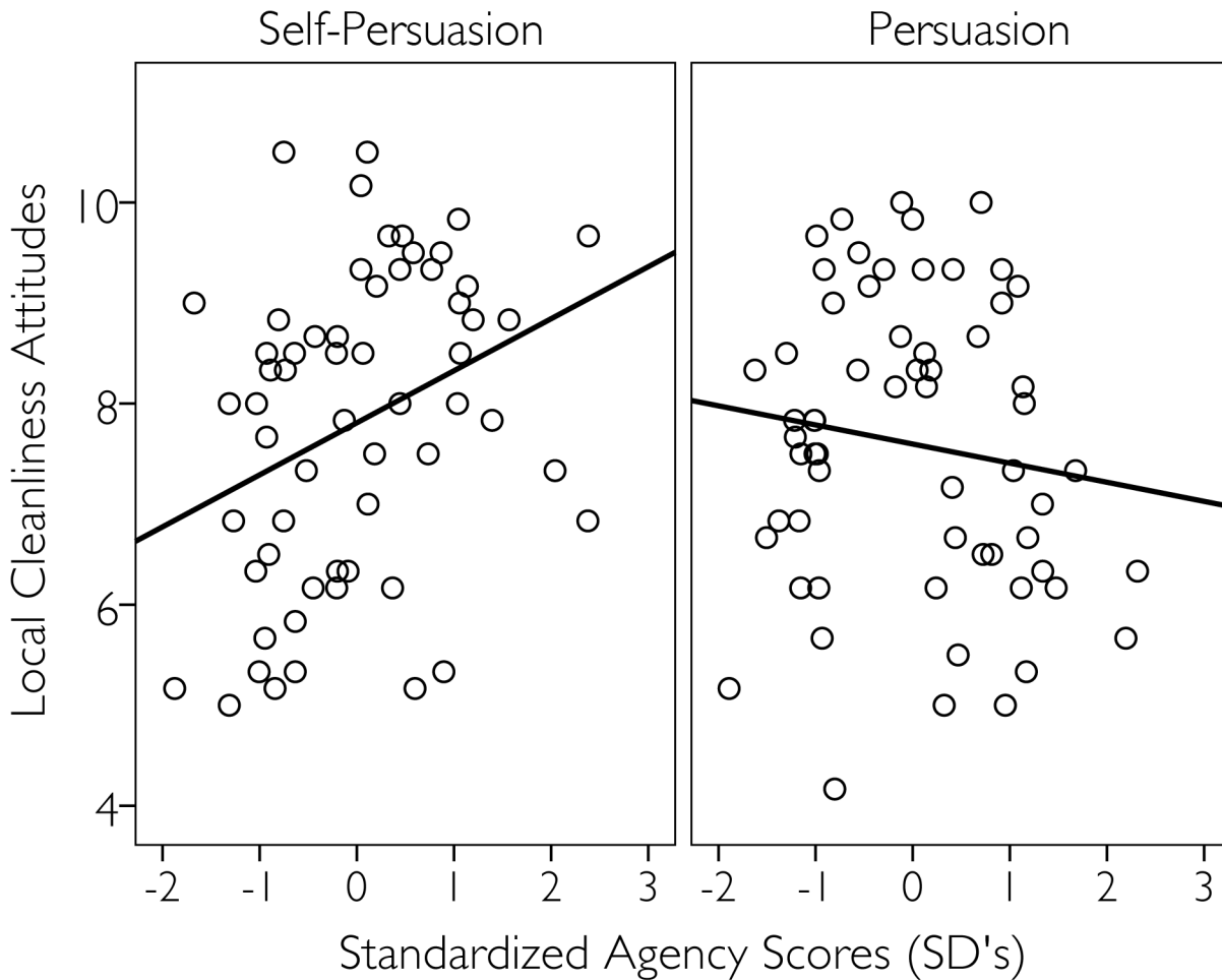
Fig 2. Mean cleanliness attitudes as a function of the mean standardized agency scores and the persuasion condition.