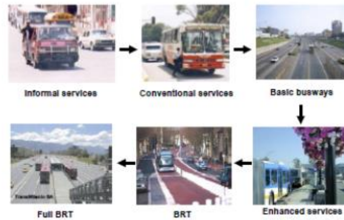
Figure 1: Various levels of organization in bus transit systems (ITDP, 2007)

A bus service can only be called Bus Rapid Transit when the bus drives on a dedicated bus lane that is often separated from other traffic, when the comfort level of buses is high, when the buses reach a relatively high average speed, and when there are dedicated and separately branded buses and bus terminals, with fare collection at the station rather than on the bus (this greatly enhances the speed of boarding and therefore the average speed of the bus service). A full BRT can mean that an entire city is connected by BRT, that feeder systems are in order (connections to other public transit methods, parking facilities for bicycles and cars, pedestrian access etc.), and that both express and regular services are provided on double lanes (so buses can overtake each other) (ITDP, 2007).