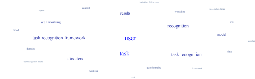
Fig. 1. Example of a tag cloud as it was shown to the user.

scores in each of the three lists relative to the maximum and minimum scores. We then calculated for each term the average of the three normalized scores. We ordered the terms by the combined scores and extracted the top-150. These terms were judged in alphabetical order by the owners of the document collections. We asked them to indicate which of the terms are relevant for their work. There was a large deviation in how many terms were judged as relevant by the users (between 24% and 51%), but on average, around one third of the generated terms (36%) was perceived as relevant.