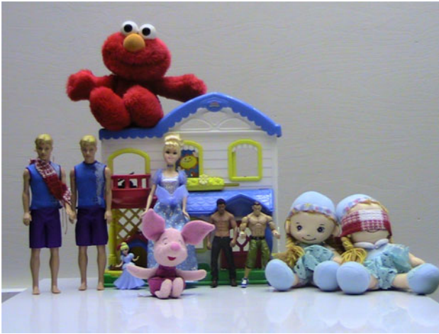
Fig. 1 The figure displays the stimuli used in the experiment. The doll in the front shows the main protagonist Piglet. The dolls behind Piglet show (from left to right) the two male dolls used in the basket task, the two princesses used in the balcony and the dog's house task, the two male dolls used in the wall task, and the two girls used in the letter task. The doll on the top of the toy house is Elmo who has been employed for the balcony and the dog's house task

After admitting that he could not perform the action himself, he articulated that he could ask one of his friends for help. He subsequently approached his friends. The experimenter asked the child to show him which of his two friends Piglet would ask for help, using the same test question: "What do you think: Which of his friends is Piglet going to ask for help?" If the child did not react, the question was repeated in another wording: "Who is Piglet going to ask for help?" If the child made the correct choice, he or she was further asked to justify why Piglet would ask this friend and not the other. The order of tasks was balanced among participants with the exception of the balcony task and the dog's house task; as both tasks involved the same dolls, they were always presented after each other.