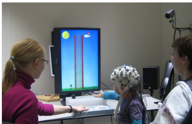
Fig. 1 The experimental setup of the joint button-pressing game. In front of a tilted wide-screen, we positioned two chess-clock buttons and resting positions marked by hand contours. By pressing the two buttons alternately, a cartoon figure could be moved up a ladder on the screen

action partner and together with a third actor in the joint action observation condition. In the current study, we concentrate on the results of the joint action and the joint action observation condition. 1