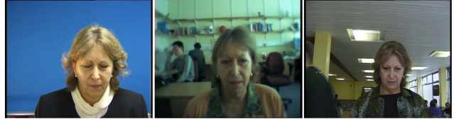
(a) BANCA database: controlled, degraded, and adverse scenarios.