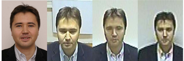
(b) SCface database: enrolment/mugshot image; test images from close, medium and far distances.