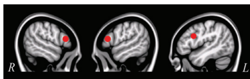
Figure 1. ROIs: Figure 1 shows the location of the 3 predefined ROIs. Left brain: RIFG, pars triangularis ( 50, 34, 12 ) and middle: LIFG, pars triangularis ( -54, 26, 14 ). These coordinates represent the center of activation for integrating speaker identity and sentence meaning as observed in healthy adults (Tesink et al. 2009b). Left: LIFG, pars opercularis ( -46, 12, 26 ). These coordinates reflect the phonologic integration area (needed for voice-based inferences of speaker's identity) found in a meta-analysis of the linguistic involvement of the prefrontal cortex (Pettersson et al. 2004).

To test our hypotheses about integration of speaker identity, we firstly tested the speaker-incongruent greater than speaker-congruent contrast in the control group. As we had hypothesized, both the LIFG ( -54, 26, 14 ) and the RIFG ( 50, 34, 12 ) were significantly activated. The autism group, however, failed to activate those ROIs in the speaker-identity contrast. In the inverse contrast (congruent greater than incongruent), neither