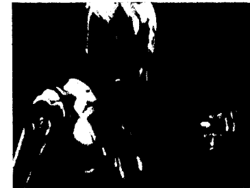
Figure 5.2: Eroticised female cyborg; image grab from Philips Robotskin TV-commercial 2008.

subjectivity of men and women? Hardly so, I am afraid; in fact, gender stereotypes are much repeated in the imagery of the cyborg. Firstly, there are many more male than female cyborgs; secondly, male cyborgs are characterised by their hard, strong and infallible body; and thirdly, the (few) female cyborgs are highly sexualised. To give a recent example: in 2008 the multinational Philips launched a campaign for a new shaver for men, Robotskin. In the one minute commercial a female, Asian looking cyborg, helps a nude man to shave under the shower. She is shy, subservient and attractive. The end of the commercial suggests that the man and the cyborg will have sex. The lighting is blue, the pace slow and languid, and the music is a mix of ambient techno that sounds vaguely Asian. While it is probably inspired by the popular videoclip 'All is Full of Love' (1998), the commercial could not be further removed from Björks radical message of (lesbian) love between human and machine. The erotic tone and setting of the Robotskin commercial could also not be more different from the two car commercials that I introduced at the beginning, which gave us the figure of an exclusively macho fusion between man and car/machine.