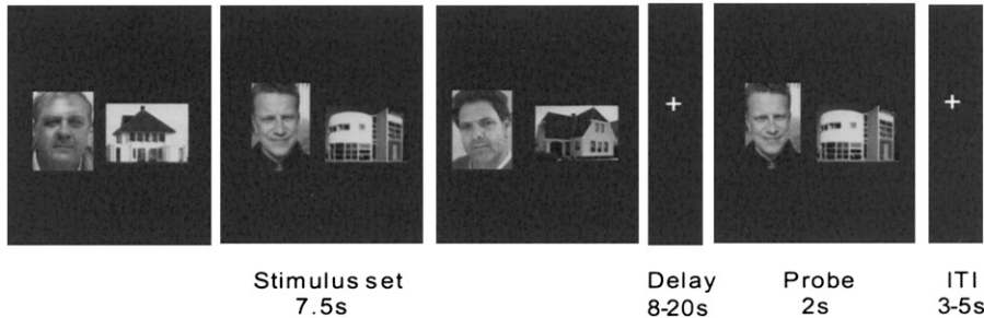
Figure 1. Experimental design. This figure depicts an example of the between-domain association condition. During the delay, participants had to maintain the combination of each item pair presented in the stimulus set. Following the delay, a probe was presented and the participant had to indicate whether the probe was a match from the stimulus set or not. Trials were separated by a variable intertrial interval (ITI).

sagittal slices, 256 \times 256 matrix, 1 mm, slice thickness, 0.5-mm gap, 256-mm field-of-view).