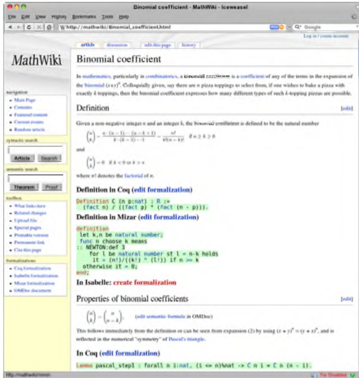
Figure 2. A MathWiki mock up page.

proof assistant itself—although it is an interesting challenge to maintain the consistency of a large online formal repository that is continuously changed and extended through the web. The stability will also have to be ensured by a committee that ensures that the library evolves in a natural and meaningful way.