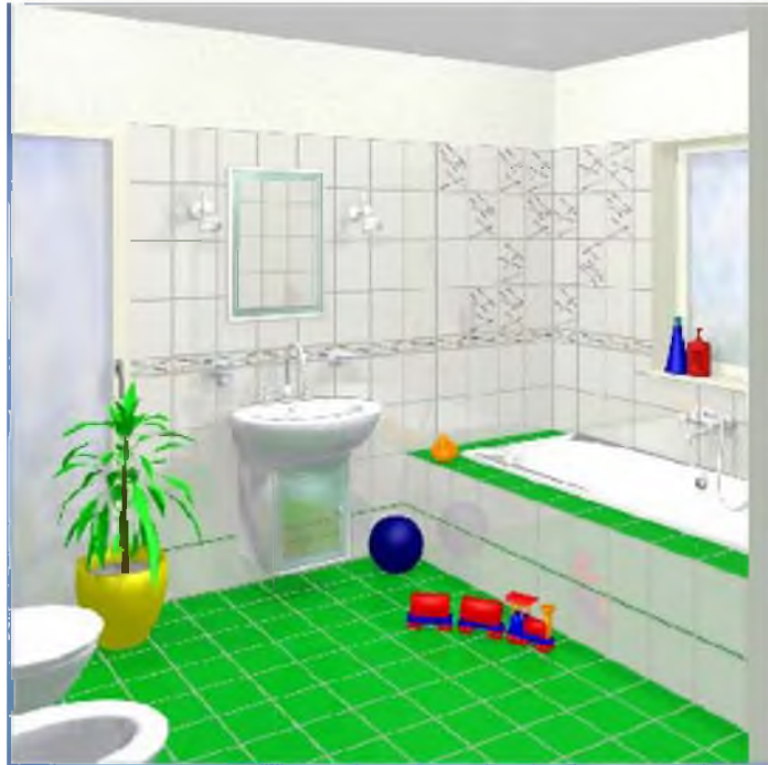
Figure 2. Display of a proposal for a bathroom decoration. All items shown can be discussed and changed interactively.

In the remainder of this paper we will discuss the cognitive research and technology development that are needed to build applications such as the multimodal supportive bathroom design tool and other services that provide help to users who are not in the position to ask very specific questions. We will also elaborate on some of the logistics issues that must be taken into account when developing and deploying eWork and eCommerce devices. Last but not least, we will touch upon the issue of what might be suitable business models for eWork and eCommerce services.