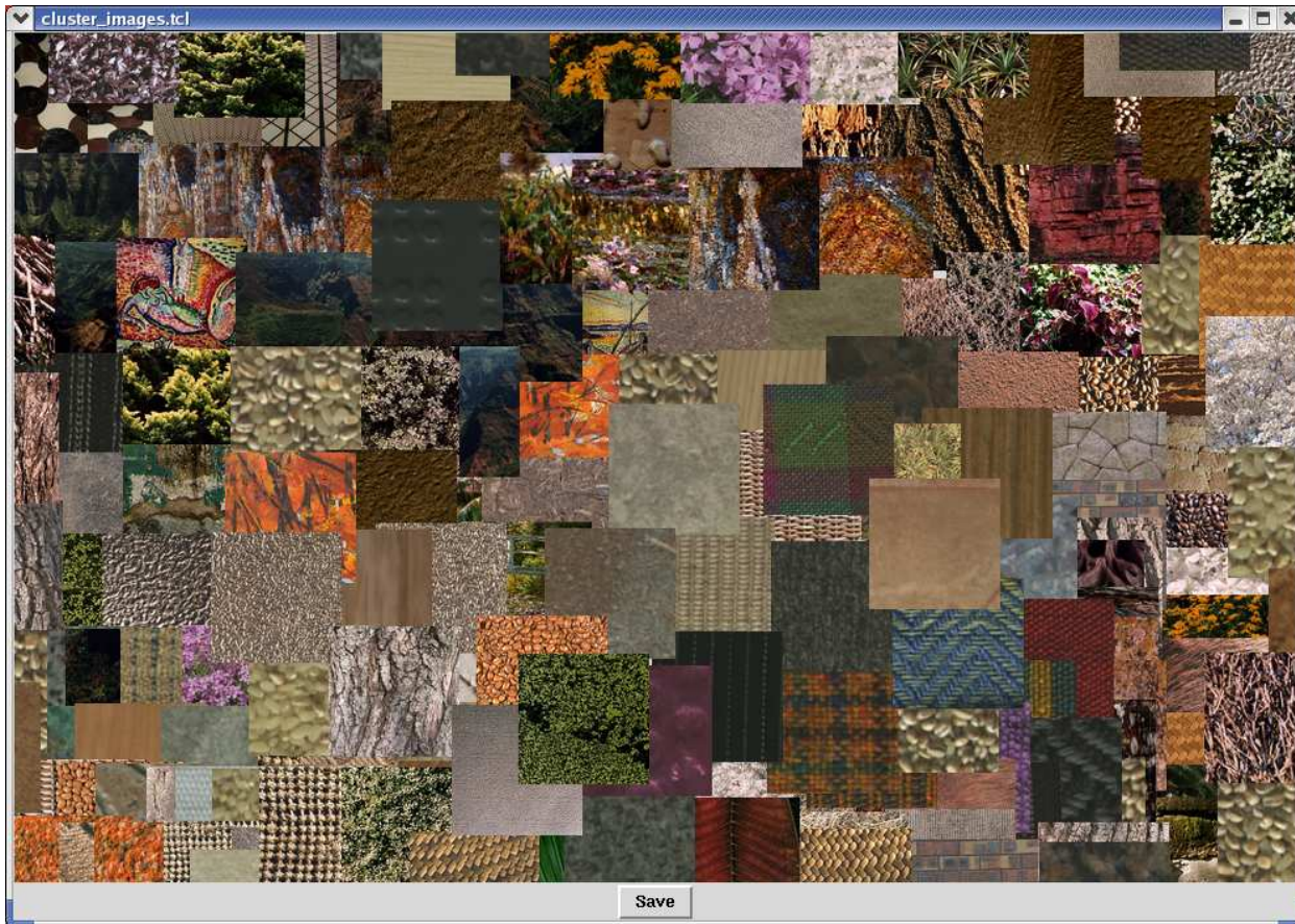
Figure 1. An overview of all 180 images (the color version) used in the clustering experiments with both human participants and the automatic classifier.