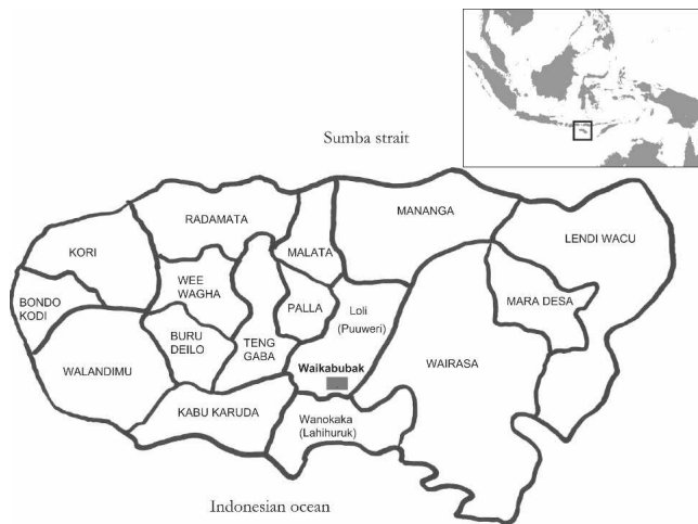
FIGURE 1. A sketch map of the West Sumba District and its geographic location within the Indonesia archipelago (inset). The map shows the administrative division of the district into sub-districts, whereby in each sub-district, a public health center provide medical and health service for the public. Loli sub-district (Puuweri) is located entirely inland, whereas Wanokaka (Lahihuruk) has several villages along the southern coast of the Sumba island.

microscopic field and 8,000 leukocytes/ \mu L of blood. Slides were declared negative if parasites could not be detected in 100 microscopic fields. The parasite count was classified as follows: +, 1–10 parasites were found per 100 thick film fields; ++, 11–100 parasite were found per 100 microscopic thick film fields; +++, 1–10 parasite were found per 1 thick film fields; +++++, more than 10 parasites were found per 1 thick film fields. 3