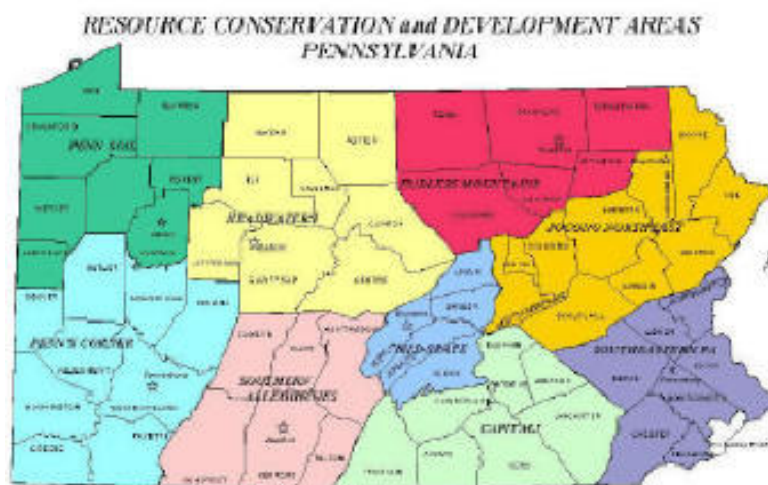
Figure 1 Situation of the Southern Alleghenies in Southcentral Pennsylvania.

The Southern Alleghenies was recognised as a Resource & Community Development (RC&D) area in 1990. RC&D is a USDA program administered by the National Resources Conservation Service (NRCS). The purpose of RC&D is to accelerate conservation, development, and utilisation of natural resources; to improve the general level of economic activity; and to enhance the environment and standard of living in designated RC&D areas. In addition, the program works to improve the capacity of local citizens to plan and implement programs and projects that address natural resource and community development issues within and across communities of a geographic region. Program objectives address: improvements to the quality of life, including social, economic and environmental concerns; continuing prudent use of natural resources; and strengthening local citizens' ability to utilise available sources of assistance through USDA and other Federal agency partnerships (USDA, 2006b: 23).