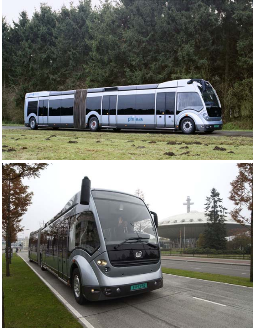
Figure 2: The Phileas bus.