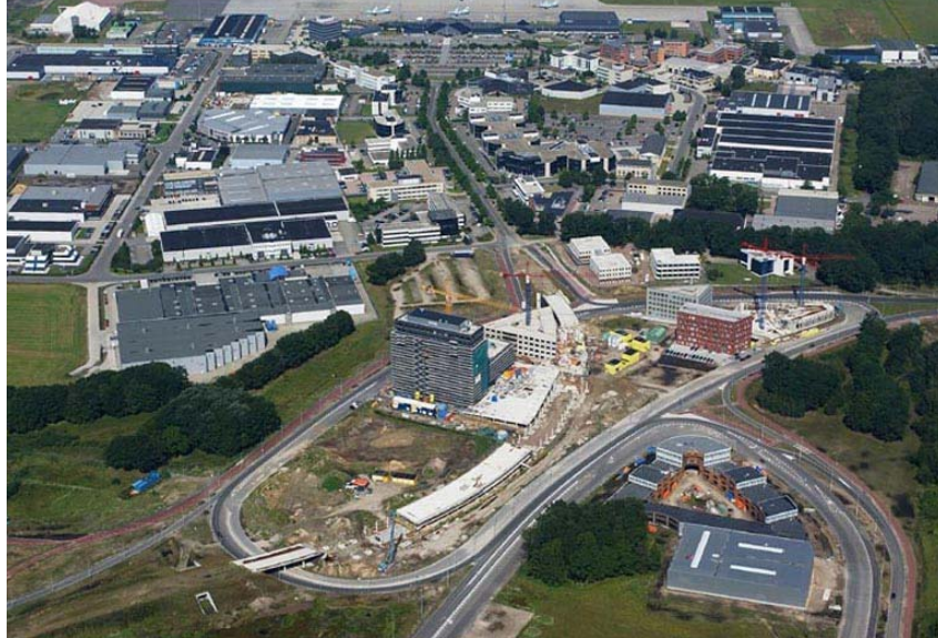
Figure 4: Phileas lane under construction at Eindhoven airport / Flight Forum.