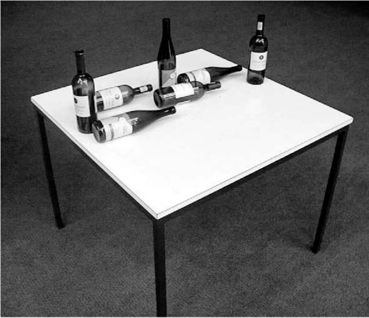
Figure 2. Three bottles standing and four lying on table top (PSPV 46)

and so forth. The full set is published in Levinson and Wilkins (2006: 570–574), but is also available from the Max Planck Institute for Psycholinguistics website ( www.mpi.nl ).