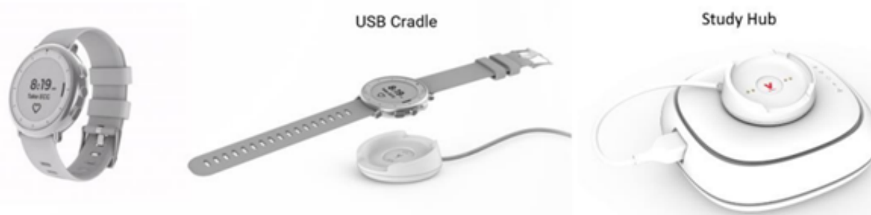
Figure 2. The Verily Study Watch, along with syncing and charging cradle and Verily Study Hub.

accelerometer, gyroscope, and a photoplethysmography. The device is not CE (Conformité Européenne) marked or cleared in the United States. The device enables the collection of physiological and environmental data about movement and activity, pulse rate, and skin impedance. Data from the Verily Study Watch will be encrypted and sent securely to the Verily Cloud using a USB syncing and charging cradle and wireless connectivity bridge (Verily Study Hub; Figure 2 ). The Verily Study Watch has been deployed in several studies, including the Baseline Health Study [37], the Parkinson Progression Markers Initiative [38] in the United States, and the Personalized Parkinson Project [39] in the Netherlands.