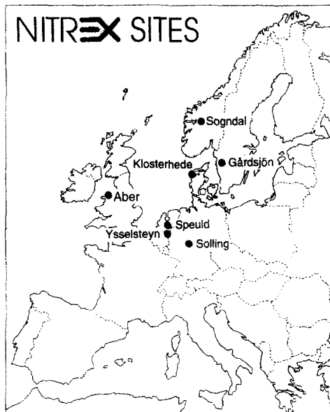
Fig. 1. Location of the NITREX sites.

The large-scale experiments of the NITREX project (nitrogen saturation experiments) are designed to provide such information at the ecosystem scale (Wright and Van Breemen, 1995). NITREX is a consortium of European experiments in which nitrogen deposition is drastically changed to whole catchments or large forest