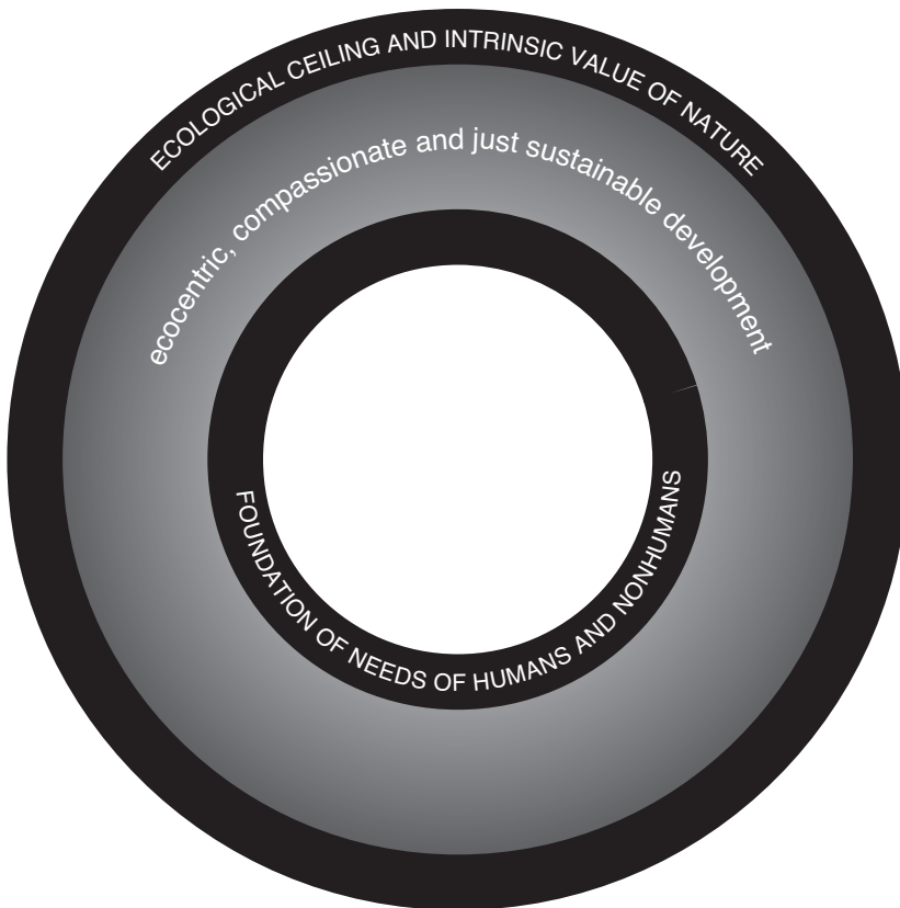
Figure 4.2 The ecocentric, compassionate and just doughnut economy (adapted from Raworth, 2017).

Instead, approaches such as Raworth’s doughnut economy prioritize the ecological and social SDGs to inform how to operationalize the economic ones to create a “safe and just space for humanity” (Raworth, 2017: 218). However, Raworth’s doughnut mainly focuses on human justice, since the planetary boundaries are based on an instrumental perspective, and not necessarily on the intrinsic value of nature. Two important omissions of the doughnut include: (a) attention to the interests of the individual animal – it does not address speciesism, and (b) the intrinsic value and rights of nature. Therefore, we propose to include nonhuman animals and nature in the consideration of the safe and just space – so an ecocentric, compassionate (Bekoff, 2013) and just doughnut economy (see Burgerboerderijen, 2021 and The Vegan Society, 2021) (Figure 4.2). In line with the