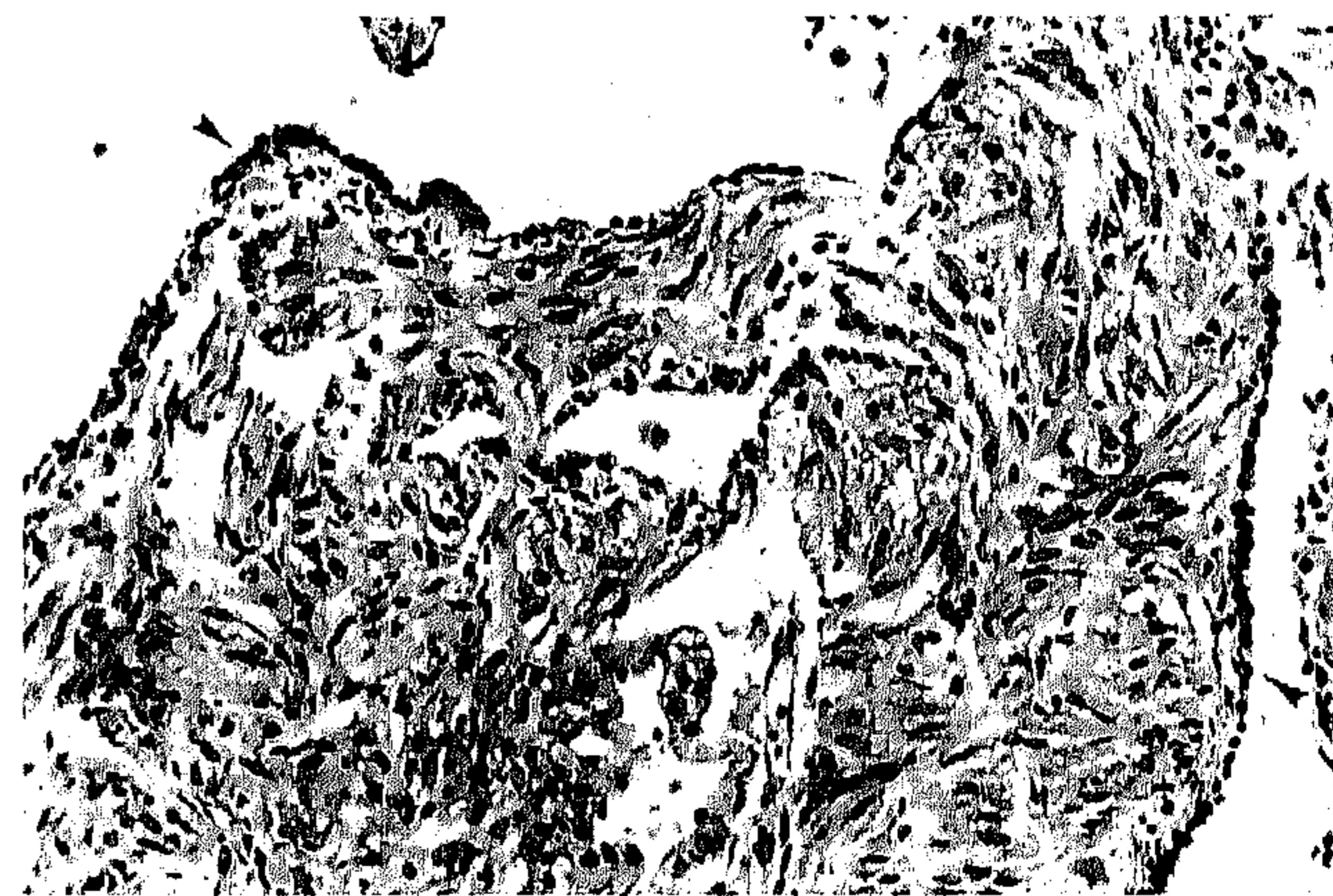
FIGURE 1. LAM. There is a diffuse proliferation of smooth muscle cells along bronchioli (arrowheads) and lymphatics with formation of cysts (hematoxylin-eosin, original X200).

Four months later, the patient underwent a total hysterectomy because of severe hypermenorrhea. During this procedure a bilateral oophorectomy was performed by request of the physicians. Histologic examination of the uterus revealed a low-grade leiomyosarcoma.