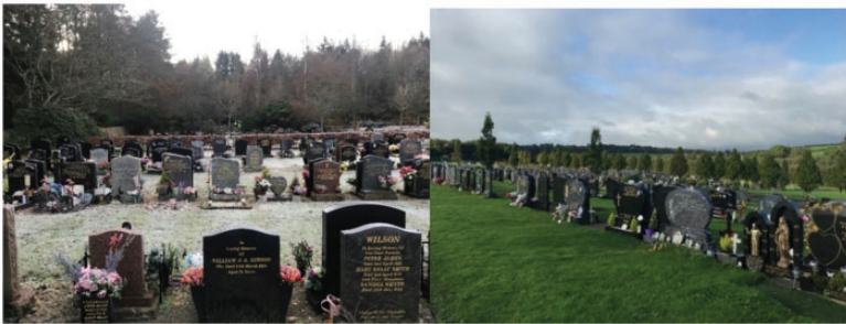
Figures 4–5. Examples of cemeteries in Ireland and Scotland. From left to right: photos from Birkhill cemetery in Dundee; St James’ cemetery in Cork.

As places of mourning, bereavement, and consolation, cemeteries and crematoria gardens accommodate personal as well as social and environmental functions (Jedan et al., 2019). The meaning of the individual/private grave, and how it is shaped and decorated, is of importance for mourning and remembrance (Pettersson & Wingren, 2011). Further, interactions with ‘deathscapes’ are not just experienced through the materiality of physical spaces, but also and at the same time through embodied-psychological experience and various forms of virtual space, including both digital spaces and arenas of belief and belonging, such as idea of ‘heaven’ (Maddrell, 2016). This embodied experience of loss, mourning, and consolation is also frequently reflected in a sense of a continuing bond with, and/or responsibility to, the dead (Klass et al., 1996; Klass & Steffen, 2018). This highlights the complexity of emotional-affective environments, particularly those connected to the disposition of the dead, mourning, and remembrance, and how this is culturally inflected. This in turn demonstrates the social and cultural significance of cemeteries and crematoria gardens, and the importance of their organisation and management, including their diversity-readiness .