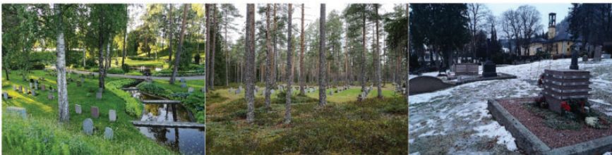
Figures 1–3. Examples of cemeteries in Scandinavia. From the left to right: photos from the main cemetery St Eskil in Eskilstuna; woodland cemetery Röbbäck in Umeå; collective memorial at the central cemetery Bragenes in Drammen, the yellow building in the back is the crematorium.