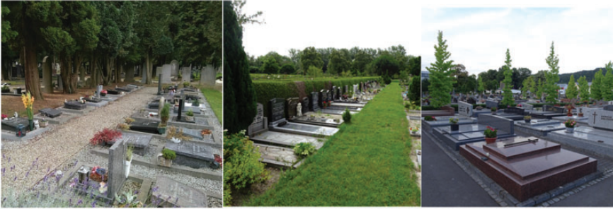
Figures 6–8. Examples of cemeteries in The Netherlands and Luxembourg. From left to right: photos from Tongerseweg municipal cemetery in Maastricht; municipal cemetery Noorderbegraafplaats in Leeuwarden; Notre Dame in Luxembourg-City.