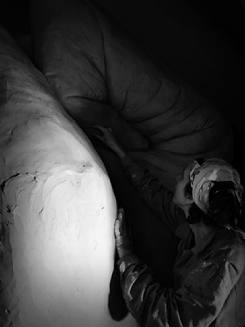
Caption: Form construction during the production of Anna Lena Grau's sculpture Moule (2015), view of the studio.