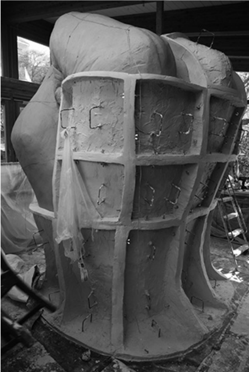
Caption: Lost mold from clay during the production process of Anna Lena Grau's sculpture Moule (2015), view of the studio.