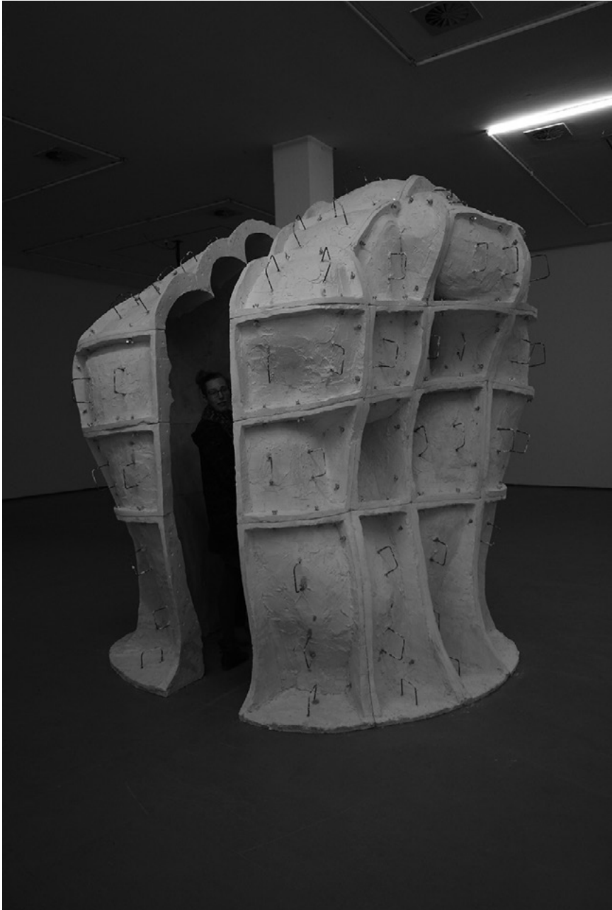
Caption: Anna Lena Grau, Moule , 2015 View from the outside, plaster, carbon steel, 300 x 215 x 265 cm