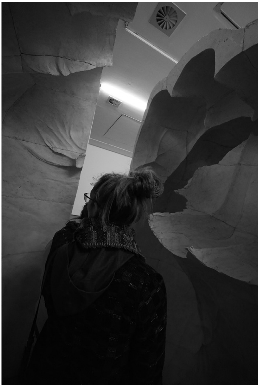
Caption: Anna Lena Grau, Moule (2015) View from the inside, plaster, carbon steel, 300 x 215 x 265 cm