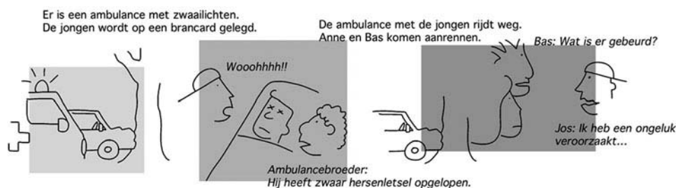
Figure 2. Example of cartoon on one page with three frames. Translation of the cartoon from left to right: There is an ambulance with flashing lights. The boy is placed on a stretcher. Jos: "Woohhhh!!" Ambulance attendant: "He incurred severe brain damage". The ambulance drives off with the boy. Anne and Bas run to Jos. Bas: "What happened?" Jos: "I caused an accident..."

To measure transportation, participants completed 10 items from Green and Brock's transportation scale (2000) that were applied to the cartoon (e.g., "I wanted to know how the cartoon ended"; "I was mentally involved in the cartoon while reading it"; "While I was reading the cartoon, activity going on in the room around me was on my mind" (reversed).