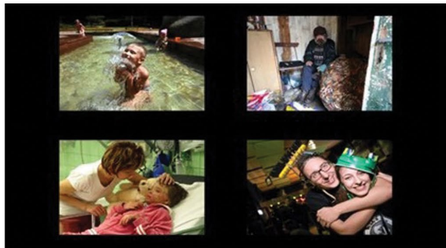
Fig. 1 Right: an example slide from the social block, in which two positively valenced pictures (top left and bottom right) and two negatively valenced pictures (top right and bottom left) are depicted

A distinction can be made between different components of attentional bias (Cisler and Koster 2010; Yiend 2010). Based on prior studies (e.g., García-Blanco et al. 2014; Isaac et al. 2014; Mo et al. 2019), the following three attentional indices were computed: (1) Overall engagement : total gaze duration (ms) per AOI (i.e., the total duration in ms that each participant's gaze remained fixated within the boundaries of a given AOI). (2) Initial engagement : the location of the first fixation on a given AOI in each trial. (3) Shifting : total revisits per AOI