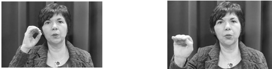
Figure 1. Stills from training video in AV-I condition showing the articulatory gesture needed for /u/ (left) and /θ/ (right).

a one-handed gesture indicating the rounding of the lips, and for the /θ/, this was a one-handed gesture indicating that the speaker should push their tongue out between their teeth (see Figure 1).