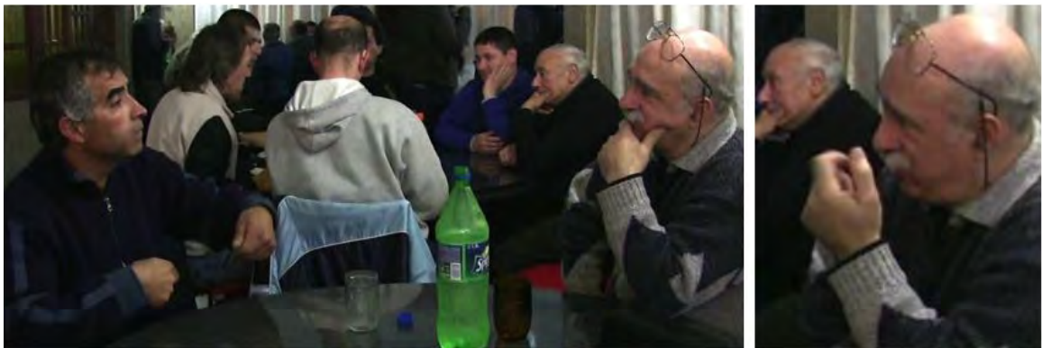
Figure 2: Stills of line 1 (L) and line 2 (R). In line 2, B initiates repair by offering a candidate understanding: ‘{of} cars?’. His raised eyebrows indicate a polar question.

Finally, there is the alternative question format type, in which the person initiating repair offers multiple candidate solutions to be accepted or rejected (Koshik 2005). This is an infrequent type, as with alternative questions generally, that appears to be a grammatical possibility in all of the languages. It is akin to the restricted offer type in offering a possible solution, rather than requesting one. Here is an example from Italian (Rossi, this issue). Speaker A mentions “ten pictures”, upon which speaker B asks: “his or someone else’s?”, presenting the prior speaker with two possible understandings. In response, Speaker A disconfirms the first of these options and affirms the second by repetition.