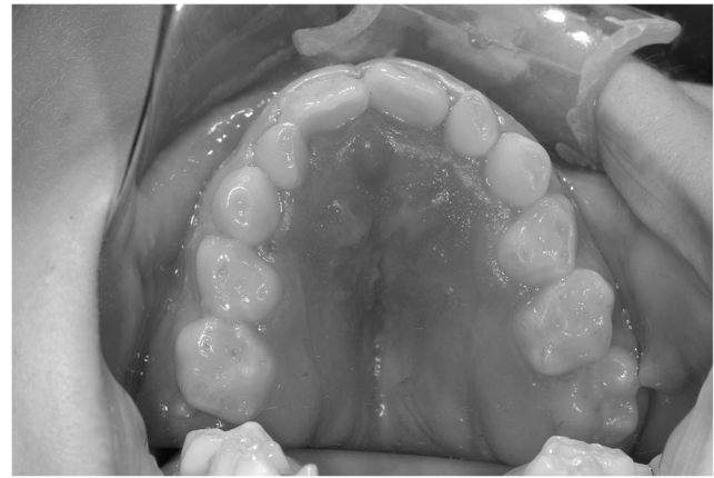
Fig. 3 Photograph of a patient with Saethre-Chotzen syndrome. Note the asymmetry of the maxilla on the right side of this 9-year-old male patient with Saethre-Chotzen syndrome

This study has several limitations. Except for one child, all patients in this study had undergone craniofacial surgery during early childhood that may have affected normal growth of the maxilla. It remains unclear whether the smaller dental arch dimensions in patients with Muenke and Saethre-Chotzen syndromes or TCF12 -related craniosynostosis is the result of craniofacial surgery or if it is syndrome-related or both. Since all patients undergo surgery at a young age, it is impossible to distinguish this further.