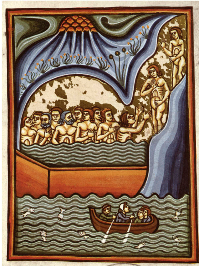
Figure 2. Petrus de Eboli, De Balneis Puteolorum et Baiarum , fol. 15r, c.1197, Bibliotheca Angelica, Rome, MS 1474. CKD, RU Nijmegen.