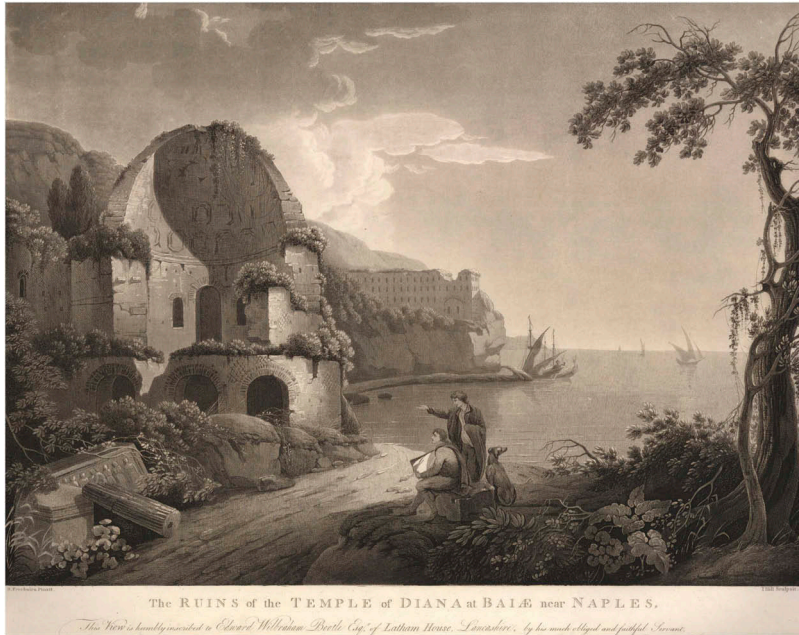
Figure 3. John Hill after Robert Freebairn, The Ruins of the Temple of Diana at Baiae near Naples , mixed print on paper, 51 × 62 cm, 1800, British Museum, London, inv. no. 1953,0214.24.

(1806): “Europe ends at Naples and it ends there badly. Calabria, Sicily and the rest are Africa.” 71 A region dotted with unidentified ruins ties in with that view. 72 It shows that the region still served as a lieu de mémoire , as it was inextricably linked with its ancient visitors.