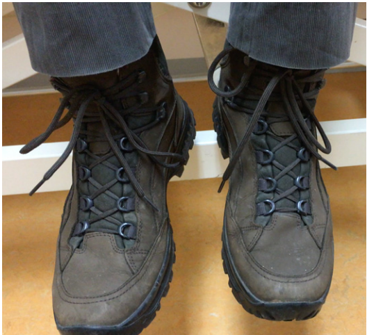
Video section B.