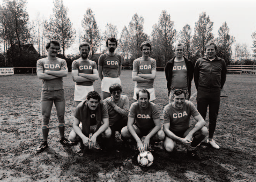
Figure 2. Politicians from the Christian Democratic Appeal party are about to play a match against a team of celebrities from the world of television and entertainment. The event was part of the 1981 general election campaign.

day. Firstly, this enabled him to associate himself with success. Van Agt repeatedly appeared at cycling events, celebrating the victories of stars like Joop Zoetemelk (who won the Tour de France in 1980), Gerrie Knetemann and Jan Raas. 18 Secondly, since cyclists and their supporters predominantly had working-class backgrounds, his love for cycling enabled Van Agt to show that he was in sync with ‘the man in the street’. Thirdly, cycling supplied a distinctive language and metaphorical landscape that allowed Van Agt and those commenting on his life as a politician to narrate his political activities in new ways. Van Agt himself compared the Tour de France with his own life as a politician, which had also been a ‘track with lots of hills and mountains’. He drew parallels between himself as a politician and road racers by stressing his ‘perseverance’, and the need to be ‘mentally’ strong. In the media and in Parliament itself the Van Agt ministry was repeatedly referred to as the ‘equipe Van Agt’ with Van Agt riding in the yellow jersey, and his battle with his main adversary, social democratic leader Joop den Uyl was also discussed through the language of cycling. 19 Fourthly, by ap-