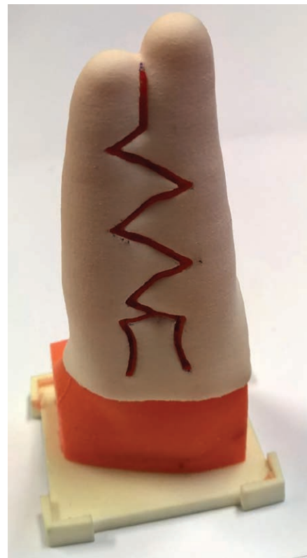
Fig. 3. Template fitted to the silicon syndactyly model. The custom-made template was placed onto a silicon syndactyly model. Thereafter, the planning could be marked with a marker pen.