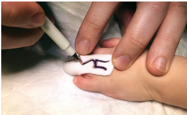
Fig. 4. Usage of the template preoperatively. Transferring the incision pattern onto the patient was easy and fast by using the template.

gle and using the transparent filter setting, an exact mirror image of the dorsal side could be drawn on the palmar side. The template had a precise fit onto the silicon model and the production costs were very low (average €50 including the planning process). Using a marker pen, it was easy to draw the delineation on the surface. The accuracy of the landmarks placed on the virtual delineation compared with the real delineation was calculated, resulting in a mean difference of 0.82 \pm 0.32 mm. Transferring the incision pattern onto the patient was easy and fast (Fig. 4), as reported by the surgeon. The template was found to be very helpful in copying the delineation from front to back. The resulting incision pattern needed minor modifications by the surgeon before the surgery was performed, not modifying the original surgical plan. The surgeries were performed without any problems, with satisfying postoperative results.