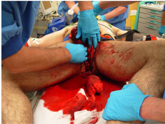
Fig. 1 Open pelvic fracture with massive hemorrhage. Initial packing in the emergency department. A pelvic binder is already applied

collected: patient demographics, mechanism of injury, vital signs in the emergency room (ER), Glasgow Coma scale (GCS) score in the ER, Revised Trauma Score (RTS), Abbreviated Injury Scale (AIS), Injury Severity Score (ISS), fracture classification according to Tile [8], severity of soft tissue damage according to Gustilo and Anderson [9], injury zone classification according to Faringer [10], concomitant injuries, amount of blood products administered during the first 24 h and/or intravenous fluids (colloid, crystalloid), treatment in the ER, operative treatment, number of surgical interventions, infectious complications within 30 days after admission as recorded in the patient chart, length of stay (LOS), mortality, cause of death, time of death after the accident, and destination after discharge. Urogenital complaints during follow-up as well as consolidation of the fracture on X-ray or CT were noted.