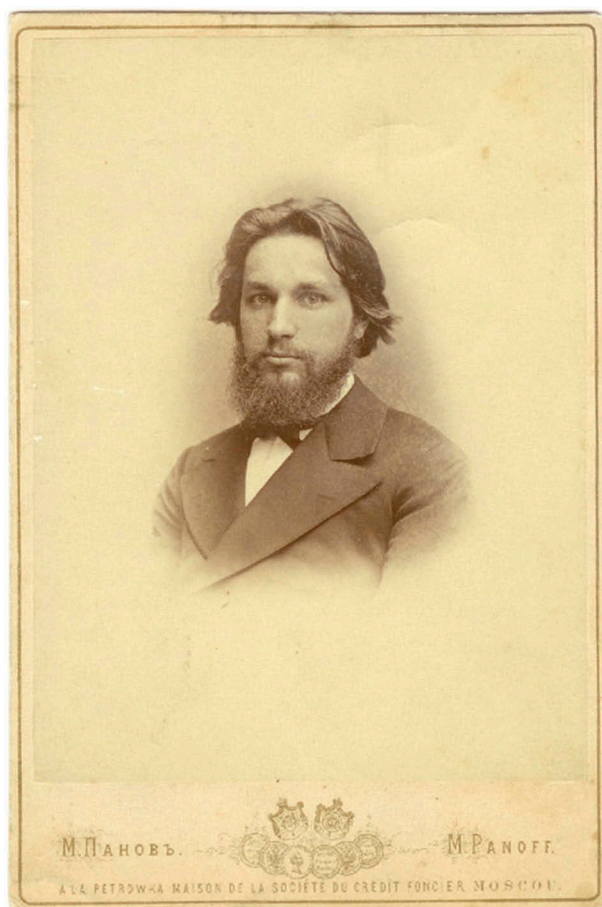
Figure 2. Sergey Korsakov (1854–1900).

colleagues. When he died in 1900 at the age of 46, he left a complete and rather voluminous classification of mental diseases, reflecting not only his broad experience with mental disorders but also his great insight into the nature of these disorders. Korsakov's interest in the effect of alcohol on the mental and neurological state of patients was inevitably enhanced during his traineeship in Sainte-Anne Hospital (Vein, 2009).