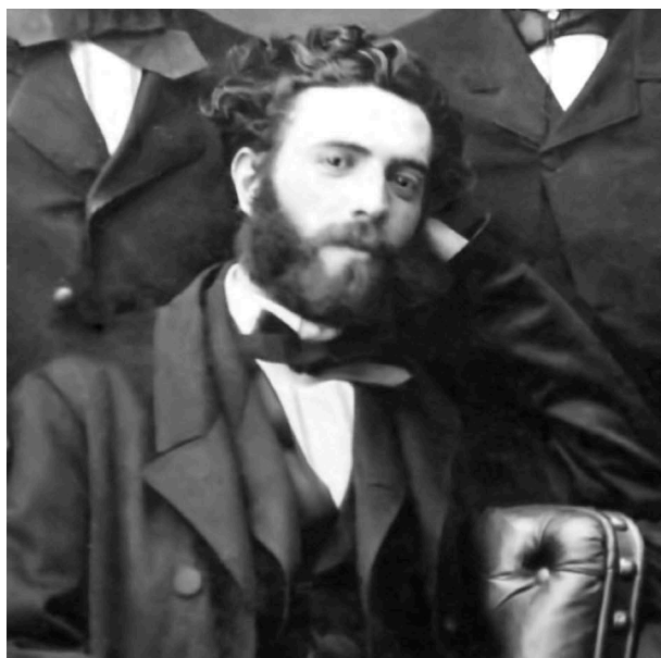
Figure 1. Valentin Magnan (1835–1916).

Sainte-Anne opened its gates on May 1, 1867, the first male patient was an alcoholic. In the early years (until the Franco-Prussian war of 1870, when patients were evacuated), alcoholics constituted approximately 22% of the male population. Over the next 40 years, diagnoses of alcoholism accounted for 23.8% of male admissions, and in another 7.3% of cases, alcoholism was listed as a contributing factor (Prestwich, 1997).