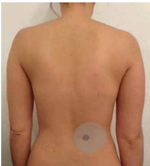
Fig. 1. Back of the patient 6 months after surgery, showing the neurectomy scar over the previous area of allodynia (shaded in a lighter gray). Centrally, the point of maximum pain is marked (shaded in dark gray).