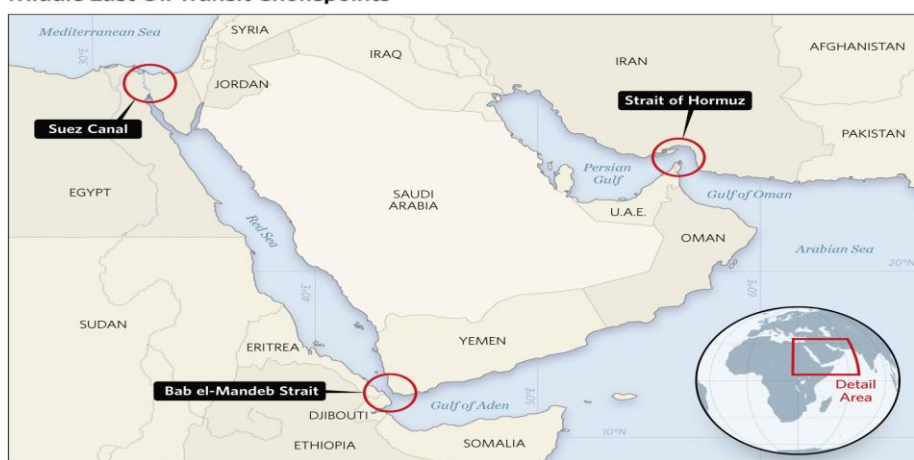
MAP 5 Middle East Oil Transit Chokepoints

SUEZ CANAL. In 2013, 915.5 million tons of cargo transited the canal, averaging 45.5 ships transiting each day. The 120-mile-long canal is an increasingly important transit route for European oil imports from the Persian Gulf.