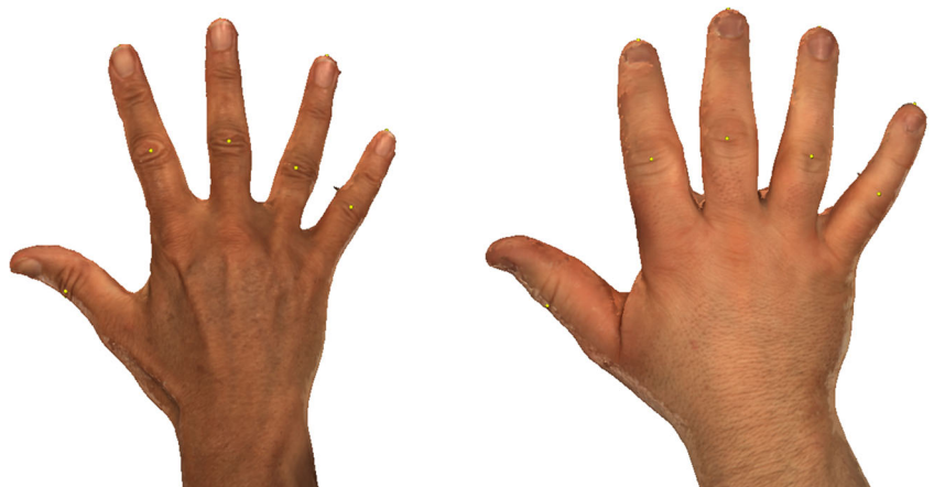
Fig. 2 Example of 3D stereophotographs of an acromegaly and control hand. This figure shows an example of a 3D stereophotograph of the hand of an acromegaly patient ( right side ) and a matched control ( left side ). Clearly visible are the differences in finger and hand dimensions and the overall volume. The yellow dots are part of the landmark positioning

Furthermore, the diameter at the proximal interphalangeal joints of the third finger was significantly larger, with a non-significant trend towards a larger interphalangeal joint in the other fingers. This could be, in combination with known persisting arthropathy [6] and the calculated volume difference, an explanation for the impaired joint function in patients in long-term remission of acromegaly, since a larger diameter in the 3D photographs is a sign of soft tissue overgrowth. A strength of this study is the matching of patients and control subjects for age, gender, ethnicity, and BMI. None of the previously published studies on problems of the hand in patients with acromegaly compared the patients to a matched control group. Furthermore, the 3D soft tissue analysis has a low intra- and interobserver measurement error, not exceeding 1 mm [17]. In this study, all measurements were performed by one experienced observer in order to reduce the magnitude of the measurement error even more. The relatively small sample size is a limitation of this study, which is caused by the strict