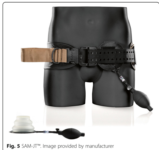
Fig. 5 SAM-JT™.

Kragh et al. compared the four junctional tourniquets in a simulated out-of-hospital situation by army medics. Unfortunately, at the time of the study, the AAJT™ was only FDA-cleared for truncal application. U.S. armed forces medics preferred the CRoC™ and SAM-JT™ over the JETT™ and (truncal) AAJT™ if they could bring one device on a mission, after testing the various designs at each other [43]. Kotwal et al. reported feedback from battlefield use. The AAJT™ was reported “to be easily broken” and the CRoC™ as “bulky, heavy and takes too