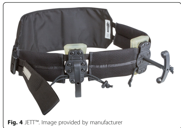
Fig. 4 JETT™. Image provided by manufacturer

flow to the lower extremities and to the pelvic region is blocked. Successful usage of junctional as well as truncal application has been reported in the military setting [49, 50]. Truncal application in animals was found to have minimal side effects when used for 30 min. Pregnancy, abdominal aneurysm and penetrating abdominal trauma are considered to be contraindications for truncal use of the AAJT™ [44].