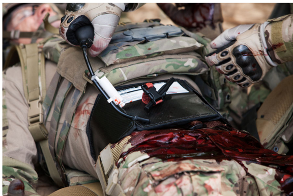
Fig. 3 AAJT™.

The Abdominal Aortic and Junctional Tourniquet™, formerly known as Abdominal Aortic Tourniquet™, can be used in several ways. We previously mentioned the use of the AAJT™ in axillary bleeding. The AAJT™ can also be placed over the groin and has a truncal application compressing the distal aorta in the infra-renal zone at the umbilical region. In this way, bilaterally arterial blood