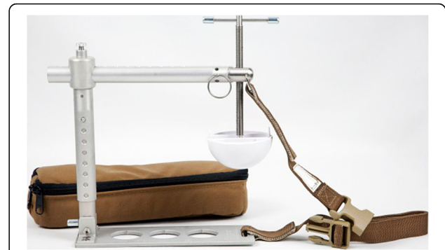
Fig. 1 CRoC™. https://combatmedicalsystems.wordpress.com/2013/05/06/combat-ready-clamp-croctm-makes-tactical-medicine-history/

The CRoC™ has been FDA-cleared for axillary haemorrhage and has shown to be effective in a cadaver model [37]. It is a device which consists of a stamp compressing the targeted area underneath. See Fig. 1. It has been