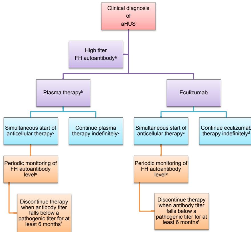
Figure 2 | Treatment of complement factor H autoantibody-mediated aHUS. There are no prospective controlled studies in patients with atypical hemolytic uremic syndrome (aHUS) due to anti-factor H protein (FH) antibodies, and thus the proposed management is based on a pediatric consensus. 11

a Abnormal titer depends on the testing laboratory.