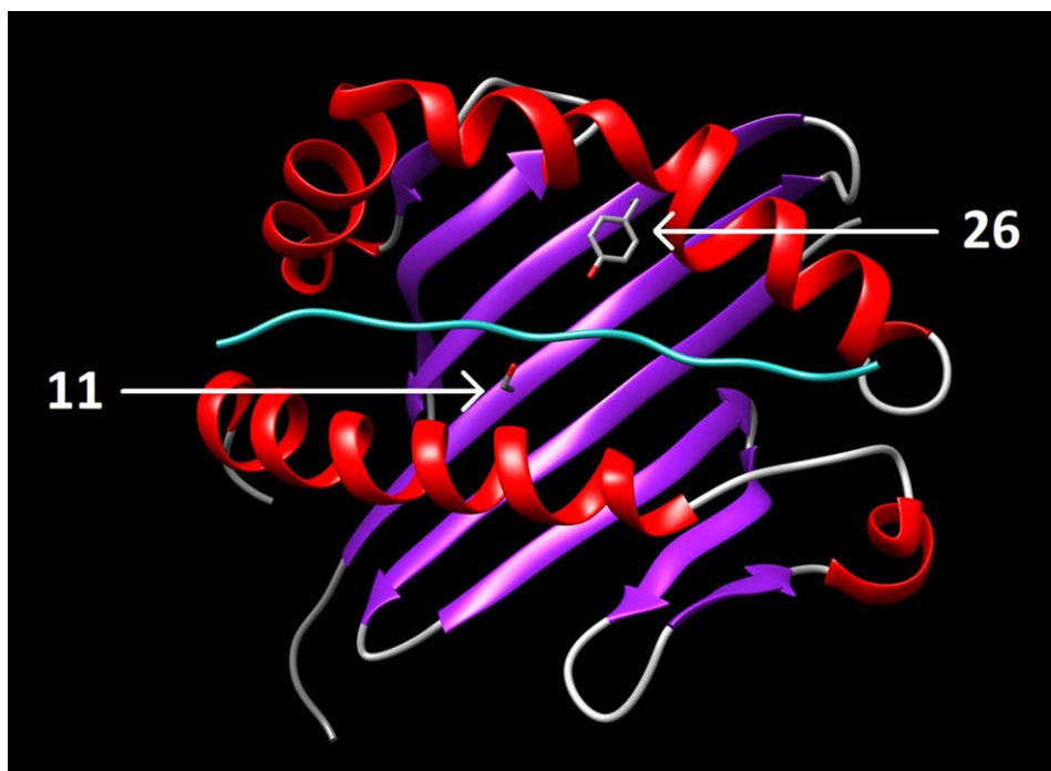
Figure 3. Locations of positions 26 and 11 of HLA-DRB1 within DR \beta -chain 1. Positions 26 and 11 are independently associated with inclusion body myositis. Arrows indicate the locations of the risk-conferring amino acids Tyr 26 and Ser 11 within the \beta -sheet floor of DR \beta -chain 1. Color figure can be viewed in the online issue, which is available at http://onlinelibrary.wiley.com/journal/doi/10.1002/art.40045/abstract .

with position 11 of HLA-DRB1. Positions 11 and 26 have been associated previously with seropositive autoimmune disease, such as systemic lupus erythematosus (32), which suggests that these positions may determine properties of the HLA-DRB1 peptide-binding groove, allowing it to preferentially bind autoantigenic peptides (Figure 3). Certain amino acids, such as a tyrosine at position 26 and serine at position 11, were associated with risk in this analysis; however, a lack of statistical power means that we were unable to completely characterize the effects of certain amino acids in this molecule. It is interesting to note that while IBM shares HLA-DRB1*03:01 as a significant risk factor with other inflammatory myopathies, such as PM and DM, the amino acid associations differ between these subtypes. In PM and DM, amino acid position 74 of HLA-DRB1 explains almost all of the risk within this gene (11). These differences in amino acid associations may be explained by the additional independent effects of HLA-DRB1*01:01 and HLA-DRB1*13:01 in IBM that are not associated with PM or DM. Understanding the peptide-binding specificities of these risk alleles may inform future research along with the potential identification of unique autoantigens presented to the immune system in IBM.