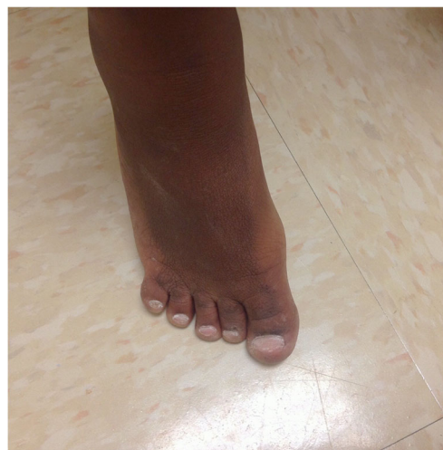
Fig. 2 Distal limb malformation in a patient with Brachydactyly of the 2-5 th toes

b Abnormal ears: large, protruding, or externally abnormal