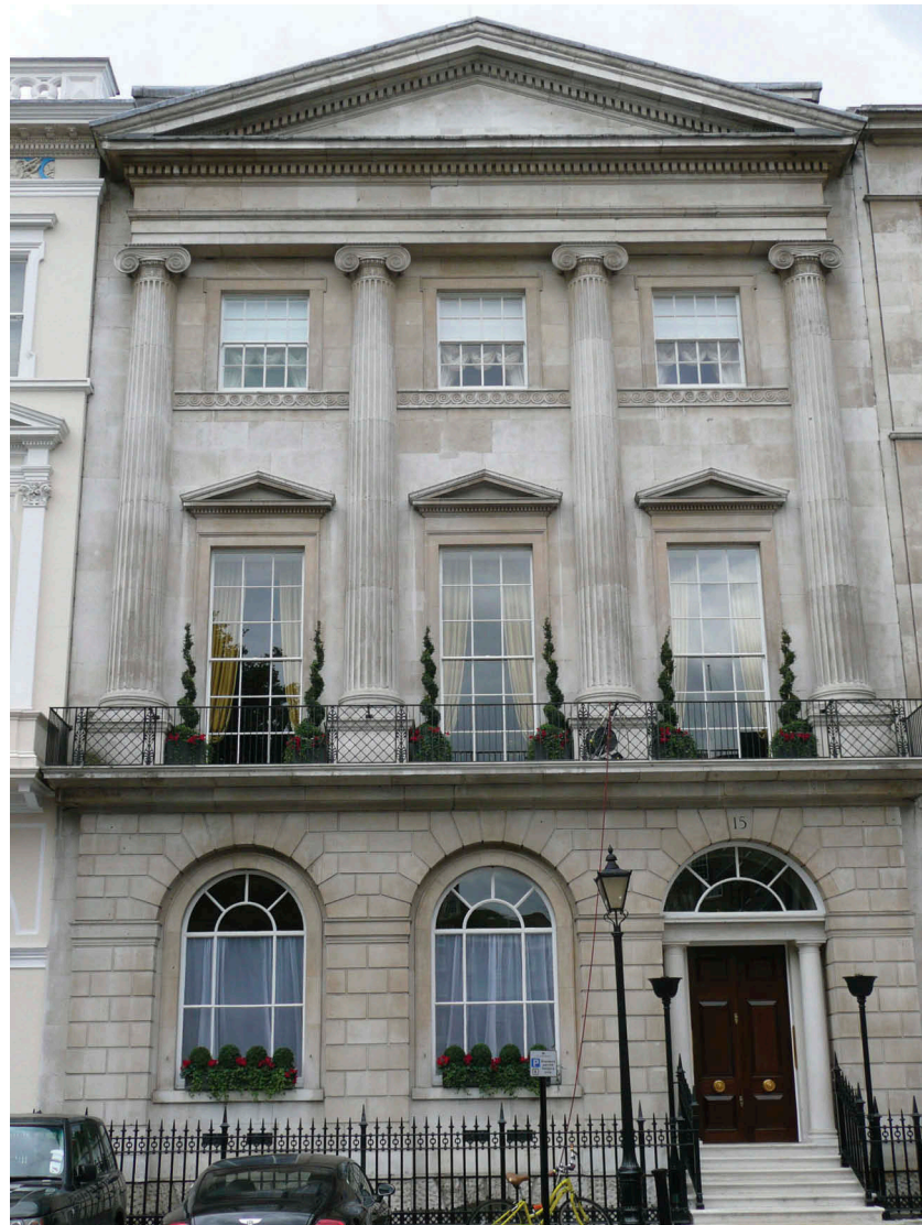
Figure 1. John Stuart. Lichfield House, St. James's Square, London, 1763–1770.

To accommodate all these paintings in a fitting environment, Verdeau rented Lichfield House, an aristocratic London townhouse on St. James's Square, which was close to the fashionable shopping area in the West End and in the heart of what was quickly becoming London's art district (Figure 1). 22 A system of gas lighting was put in place for evening