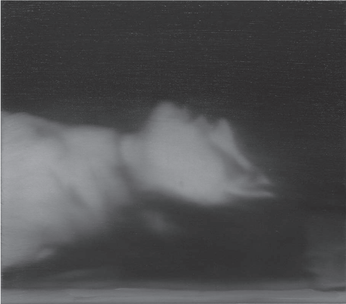
Fig. 3. Gerhard Richter, Dead, 1988, 35 × 40 cm, oil on canvas, New York: The Museum of Modern Art.