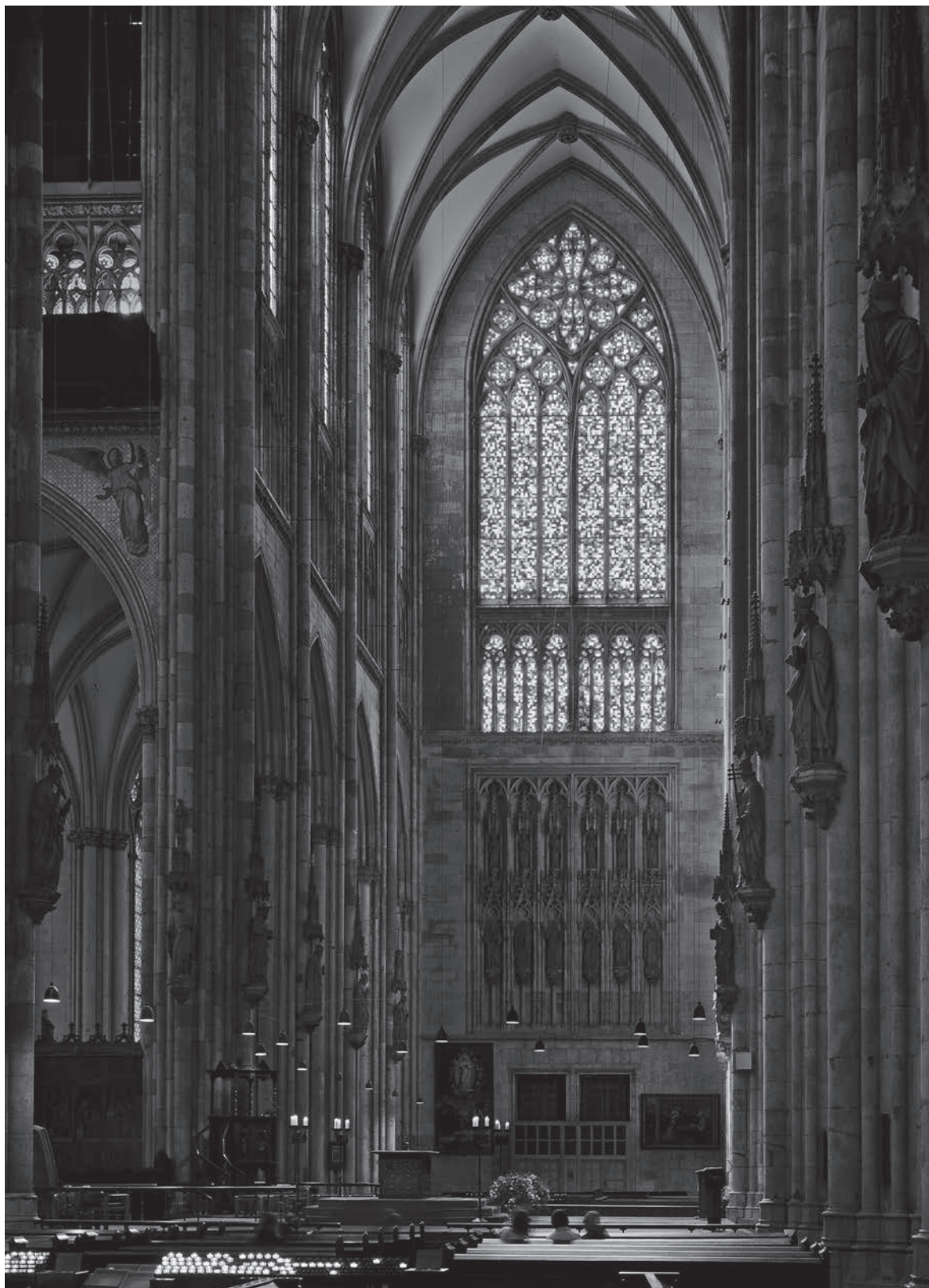
Fig. 1. Gerhard Richter, Cologne Cathedral Window, 2007, 2300 × 900 cm, genuine antique glass, mouth-blown.