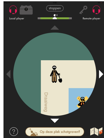
Figure 2: An in-game screenshot displaying the game from the perspective of the player ‘digger’. In the partially visible square at the bottom-right of the circle it can be observed that the ‘diver’ already reached the correct location of the key.

The therapeutic goals of the game are to motivate dysarthric individuals in using continuous speech, and to speak up and maintain predefined levels of voice pitch and loudness. Players talk to each other using headsets and the game provides feedback on pitch and loudness by analysing their speech signals. This is indicated by the horizontal green bar shown at the top in Figure 2 which provides real-time feedback while speaking and shows a green, orange or red color when the loudness is within, near or below the threshold, respectively.