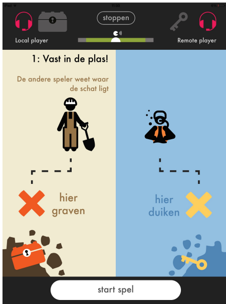
Figure 1: Pre-level instructions showing for the ‘digger’. The coloured X's depict the locations of the treasure chest and key on the map.

before starting a level in the game. The coloured X's shown in that Figure, mark the locations of the treasure chest and key on the map shown after the players started the level.