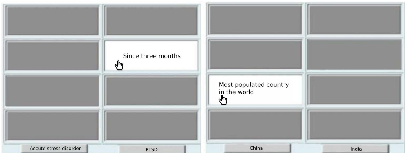
Figure 1. Example of clinical (left) and control (right) MouselabWeb matrices.

MouselabWeb matrices. In the MouselabWeb matrices ( Willemssen & Johnson, 2011 , see Figure 1 ), participants first saw eight closed grey boxes and two diagnostic labels. Hovering the mouse over a box revealed the information in that box, while moving it away closed the box again. Thus, participants saw only one piece of information at a time. Participants were instructed to inspect the information, without time-constraints, and were not required to open all eight boxes. They indicated a decision by clicking on one of the labels. Participants completed 45 clinical and 45 control MouselabWeb matrices, the latter comprising 15 tasks about countries, food, and animals, respectively. Tasks were presented to all participants in the same order.